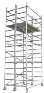
2 CORE PACKS, 4 RISER PACKS, 1 JOINER PACK, 8 JOINER CLAMPS