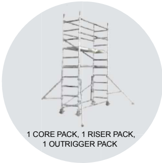
1 CORE PACK, 1 RISER PACK, 1 OUTRIGGER PACK