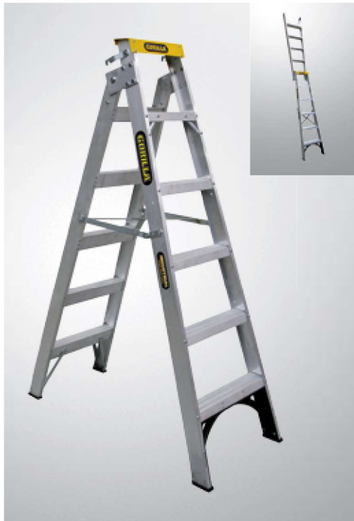
Aluminium Dual Purpose (Double Sided)

Features: Internal spreader, non-slip treads, and aluminium top-cap.