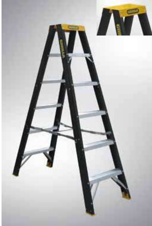
Fiberglass Double Sided A-frame

Features: Cross-braced spreader, lightweight, non-slip treads and stabiliser ready.