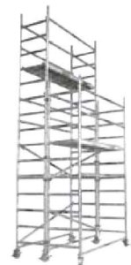
2 CORE PACKS, 3 RISER PACKS, 8 JOINER CLAMPS