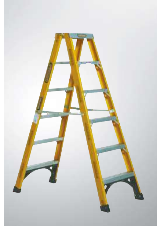
Fiberglass Double Sided A-frame

Features: Converts from double sided A-frame to straight ladder in seconds. Splayed back leg for added stability.