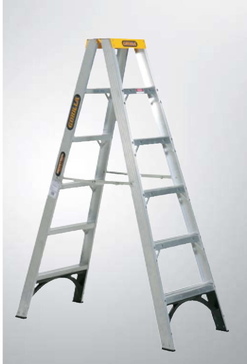
Aluminium Double Sided A-frame