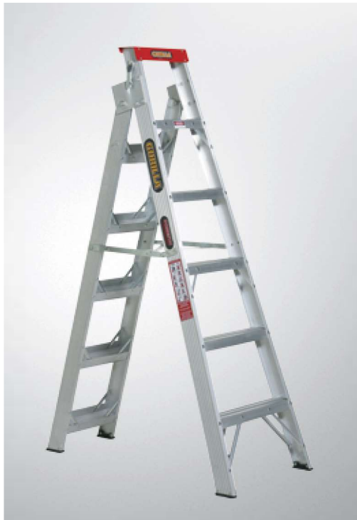
Aluminium Dual Purpose Ladder

Features: Internal spreader, non-slip treads, Aluminium top-cap, SM006-I, SM008-I and SM010-I feature patented resin bracing system.