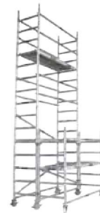
2 CORE PACKS, 2 RISER PACKS, 4 JOINER CLAMPS