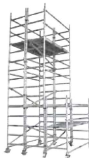
3 CORE PACKS, 4 RISER PACKS, 1 JOINER PACK, 12 JOINER CLAMPS