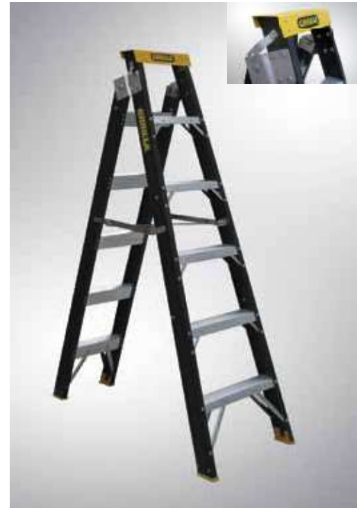
Fiberglass Dual Purpose

Features: Aluminium top-cap, internal spreader, FSM006/8/10 & 12 feature resin bracing system.