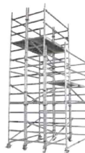
3 CORE PACKS, 5 RISER PACKS, 1 JOINER PACK, 16 JOINER CLAMPS