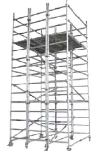
3 CORE PACKS, 6 RISER PACKS, 2 JOINER PACKS, 16 JOINER CLAMPS