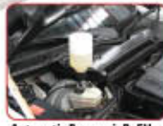
Automatic Reservoir Refiller