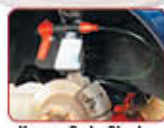
Vacuum Brake Bleeder